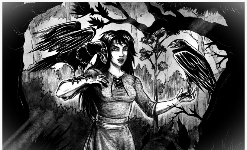
One of the illustrations in the book "The Final Days of Doggerland"