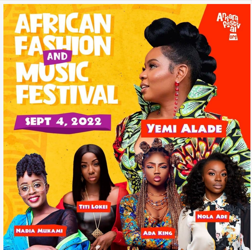
Ankara Fashion & Music Festival Performers on Closing Night Headlined by Nigerian Singer Yemi Alade