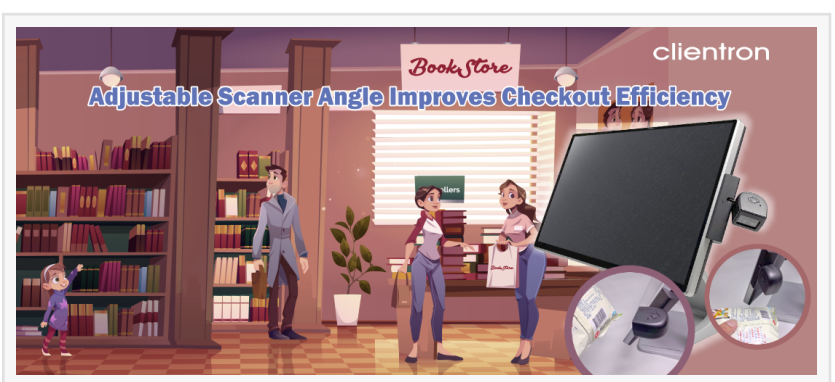
Adjustable POS Scanners Improve Checkout Efficiency

NEW TAIPEI CITY, TAIWAN, August 16, 2022 /EINPresswire.com/ -- POS system manufacturer - Clientron lately introduced a new POS system with an innovative adjustable barcode scanner