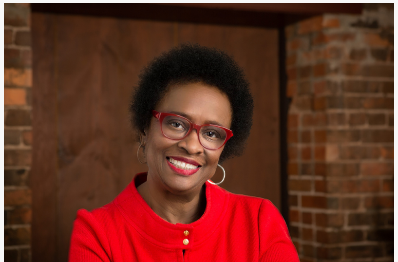
Senator Arthenia Joyner of Swope, Rodante P.A.