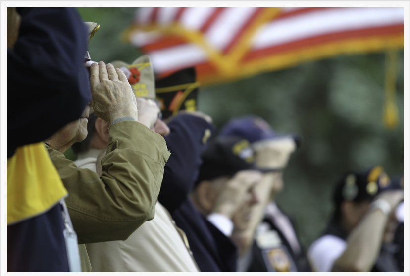
We support our military veterans.

Known companies with asbestos exposure in Alabama include, but are not limited to, Ingalls Steel Construction Company, Sanmina-SCI Corporation, Rock Wool Manufacturing Company, Bender Shipbuilding & Repair Company, Alabama Dry Dock & Shipping Company (ADDSCO), Gulf Shipbuilding Company, NASA, United States Steel Corporation, W.R Grace/Zonolite, Shook and Fletcher Insulation Company, Inc., Newport News Shipbuilding and Drydock Company, Southeast Shipyards Alabama, BAE Systems, Dwight Manufacturing Company, Gulf States Steel Company, Republic Iron and Steel Company, City Creamery, Russell Manufacturing Company, C. & G. Cooper Company, American Net and Twine Company, Anniston Cordage Company, Anniston Electric and Gas Company, Anniston Foundry Company, Anniston Manufacturing Company, Home Ice Company, Illinois Car Equipment Company, Kilby Locomotive and Machine Works, Monsanto Chemical Company, National Gypsum Company, Tornado Supply Company,