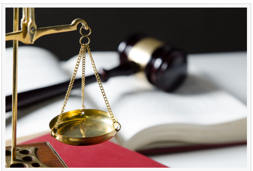
The Steinberg Law Group has decades of proven experience and the resources to help veterans obtain the financial compensation they deserve. All of it.

Jobsites and locations with known asbestos exposure in Alabama include, but are not limited to, Browns Ferry Nuclear Plant, Dothan Powerhouse, Alabama Power Plant, MacIntosh Steam Generating Plant, Gadsden Steam Plant, Colbert Steam Plant, Chicasaw Steam Plant, Childersburg Power Plant, Coosa Pines Plant, Gaston Power Plant, Wilsonville Power Plant, Barry Steam Plant, Cold Creek Plant, Miller Steam Plant, Green County Steam Plant, Segco Steam Plant, Farley Nuclear Plant, Courtaulds Chemical Plant, Gunns Power Plant, Von Braun Center, Coastal Mobile Refinery, Blakeley Island Refinery, Gulf Shipyard, Avondale Shipyard, Bethlehem Steel Shipyard, Maritime Shipyard, Mobile Shipyard, Auburn University, Bessemer Pipe Plant, Birmingham Hospital, New Providence Hospital, Brice Building,