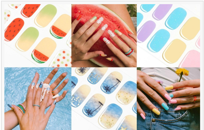
Danni & Toni's New Summer Nails Collection

/EINPresswire.com/ -- While most nail product brands emphasize primarily on personal appearance, fast growing cosmetics company Danni & Toni has always been built on bringing friends and families together for a fun and memorable nail experience. This is done through its unending focus on top technology and safety, as well as easy-to-use products with exciting designs that are perfect to put on together. And there is no better time for such activities than during the summer – and new seasonal manicure and collections make now the perfect opportunity to try some out.