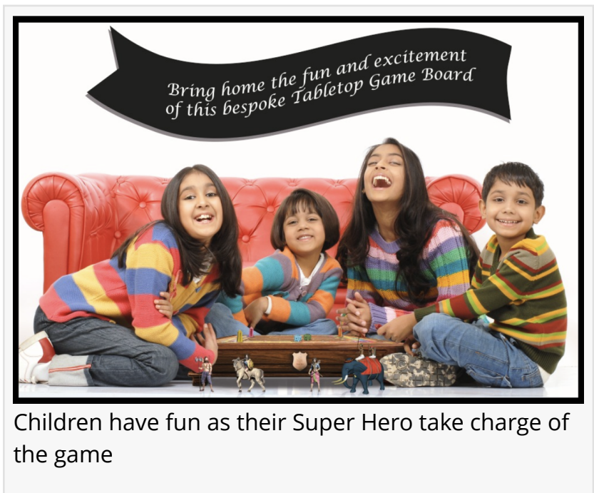
Children have fun as their Super Hero take charge of the game

The Square/Rectangular Playing surface design is game specific proprietary information using innovative idea to integrate the 360° degrees of a circle aligning the opposites of 90° and 270° and 0° and 180° within The sequential layout of the celestial sky with the Star constellations as seen through the 12 Zodiac months of a year, along with the cardinal points of East-West and North-South Axis, within a square/rectangular board interspersed with additional boxes which form relevance to the sequence for Indian/Asian culture.