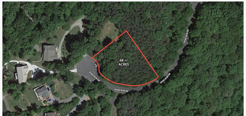
Shad Run Drive, Moneta, VA 24121