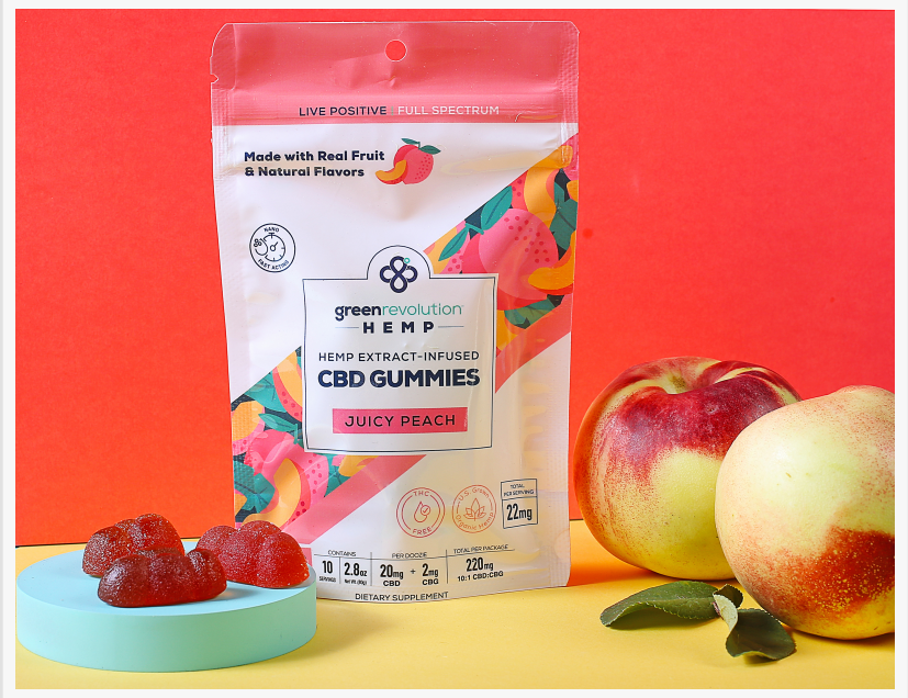
Green Revolution CBD Peach Gummies

Green Revolution CBD products are formulated to deliver benefits across 6 distinct categories of experience: Active, Focus, Happy, Recovery, Relax, and Dream. By leveraging precisely calibrated cannabinoid ratios and enhancing each formulation with rare botanicals, Green Revolution CBD finetunes each product, so it can effectively deliver its designated experience. Whether a user needs to support an active lifestyle, relax during the day, or get a good night's sleep, there is a specific experience from Green Revolution CBD that perfectly suits their needs.