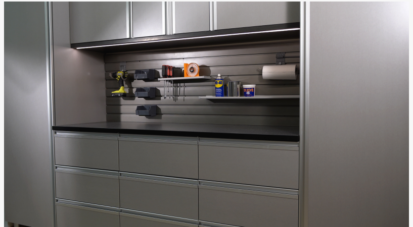
Silver custom-built garage storage by Closet Solutions of Knoxville and Chattanooga, TN

The opening of this second new showroom and warehouse coincides with a milestone anniversary for the business, which will continue to operate its original storefront in Knoxville, Tennessee as well.