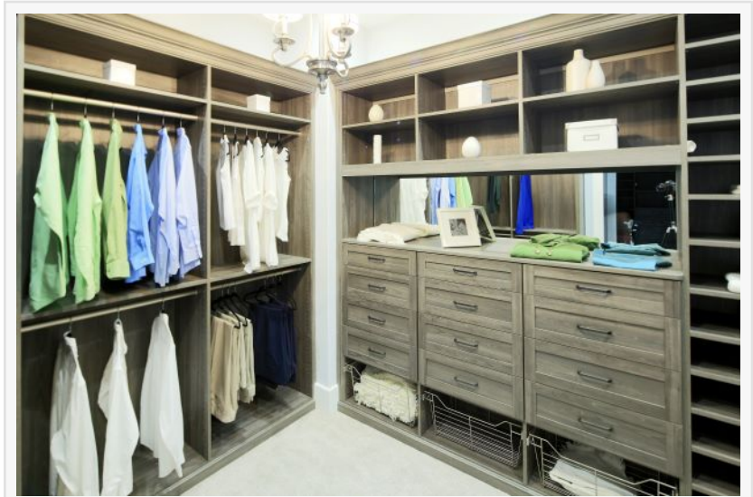
Beautifully custom-built walk-in closet by Closet Solutions of Knoxville and Chattanooga, TN

From the new Closet Solutions store, customers can expect design experts for a wide range of projects, from closets to garages. Those projects will be installed by an experienced local team. The company is locally owned and operated, not a franchise or national chain. Offering a lifetime warranty, this local business is immediately available to serve customers.