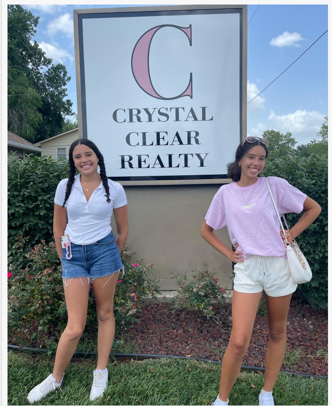
Crystal's daughters with sign