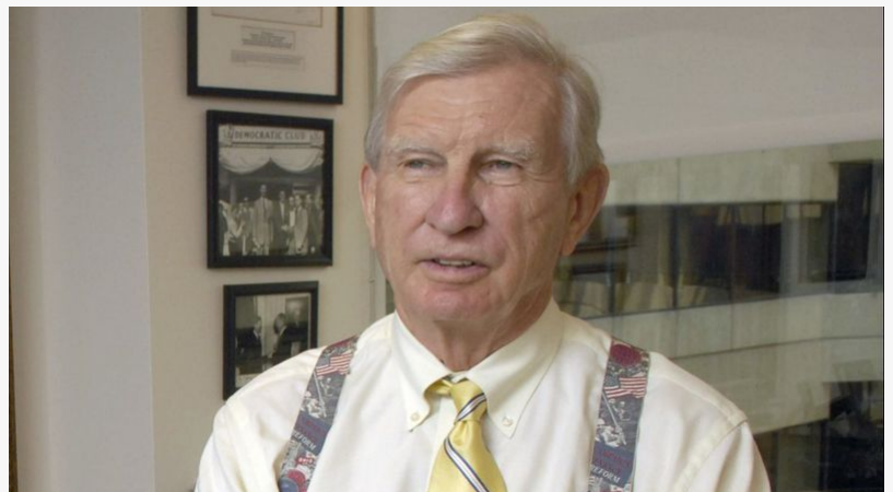
U.S. Senator Joe Tydings