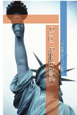
Prior Restraint Book