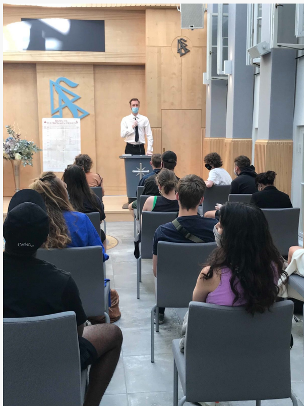
Students in Scientology Chapel