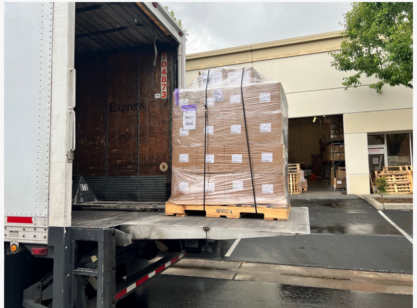
First Shipment of the dedicated 2500 units