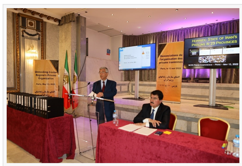
On Friday, May 13, the National Council of Resistance of Iran (NCRI) in a press conference in Paris, disclosed names of over 33,000 officials, interrogators, torturers, and executioners in Iran's Prisons Organization and over 22,000 of their pictures.

the regime's systematic crackdown on dissidents.