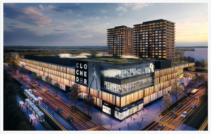
Luxembourg's Cloche d'Or