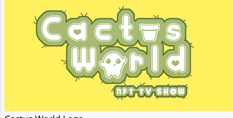
Cactus World Logo

environmentally conscious way to get involved with the launch of <u>Cactus World</u>.