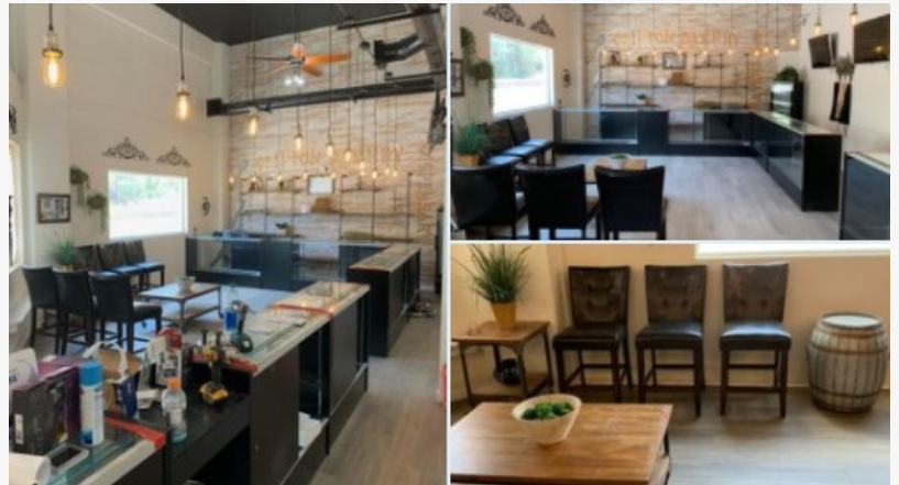
EXMT Sonoran Flower