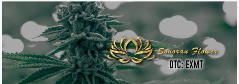
EXMT & Sonoran