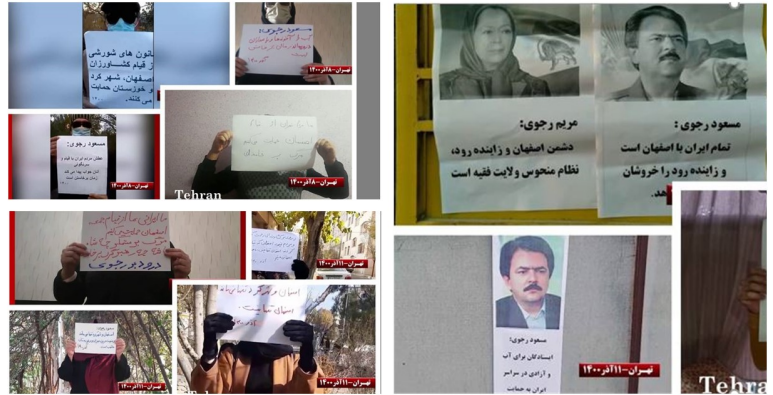
Tehran: "Iranian people's yearning for freedom will be realized through uprisings and overthrowing the regime"

(PMOI / MEK Iran) and (NCRI): Tehran— "Isfahan and Shahr-e Kord are not alone and will not remain alone". "Hail to farmers of Isfahan who protest. Isfahan is not alone". "The regime has stolen the water. It is time to rise."