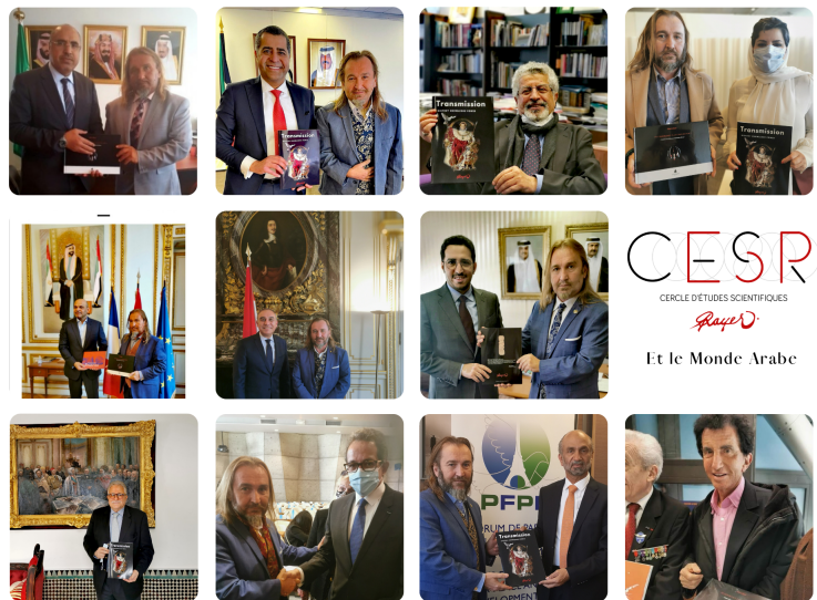
CESR and Arab world

This press release can be viewed online at: https://www.einpresswire.com/article/556451160