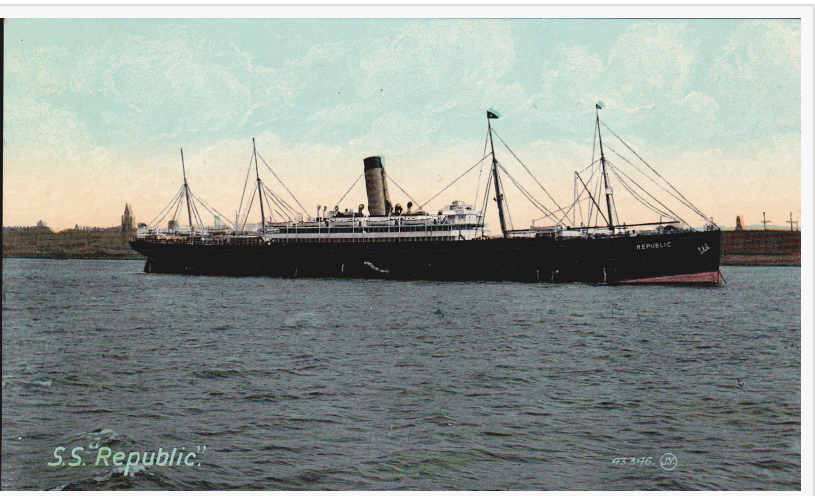
RMS Republic Postcard Circa 1907