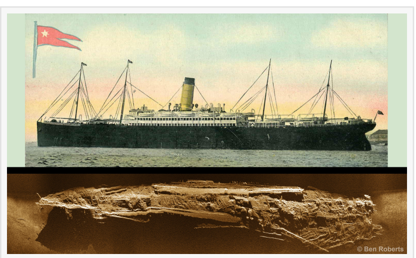
RMS Republic - Then and Now - Port

collision, allowing all passengers to transfer to other vessels via lifeboats and enough time for tug boats to begin towing Republic back to the U.S. coast for repairs. Passengers were told to hold onto their state room keys and they could retrieve all their belongings once the injured ship was safely back in port. However, Republic didn't make it. The "unsinkable ship" slipped beneath the waves on the way back with all cargo and passenger belongings still on board. At the time, RMS Republic was the largest ship to sink in history until she would be surpassed 3 years later, in 1912, by another unsinkable luxury White Star Liner you've probably heard of, Titanic. However, what was the end of Republic's story as a reliable luxury liner transporting wealthy passengers and cargo transformed into the beginning of another one - that of a lost sunken shipwreck containing, as one treasure book author put it, "riches beyond most men's wildest dreams."