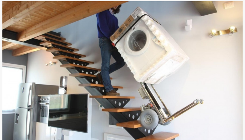
A man carries a washing machine up the stairs with the electric stair climbing dolly Buddy Lift by Zonzini