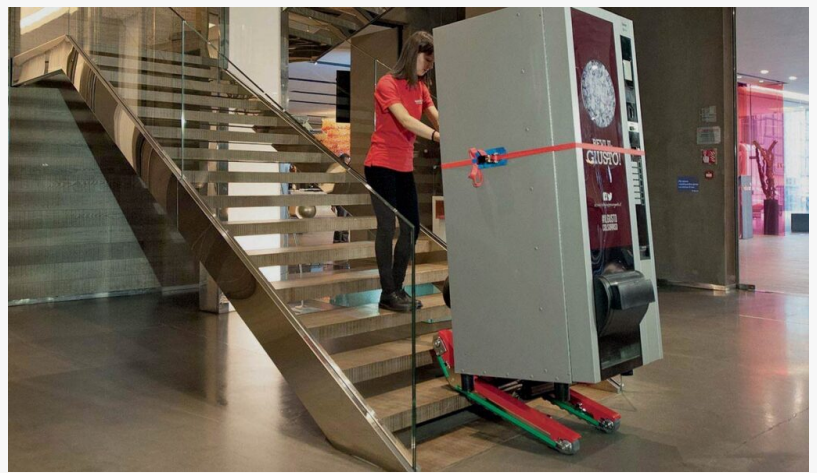
Transporting a vending machine up stairs with the stair climbing robot Domino Automatic

Stair climbing hand trucks on the other hand normally have tracks, and can carry very bulky and heavy goods, weighing up to 880 lbs. However, when very heavy goods need to be transported on stairs, it is essential that hand trucks are motorized. Heavy-duty stair climbing dollies with wheels and heavy-duty stair climbers with tracks always have one thing in common: they are electric.