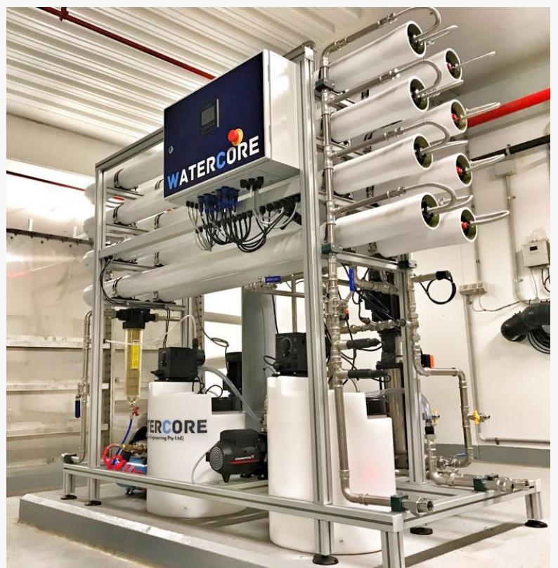
BW-RO reverse osmosis plant

Watercore BW-RO reverse osmosis plants are engineered and pre-assembled to meet a variety of industrial and commercial applications. Our systems remove 92-99.9% of suspended and dissolved solids including bacteria and viruses.