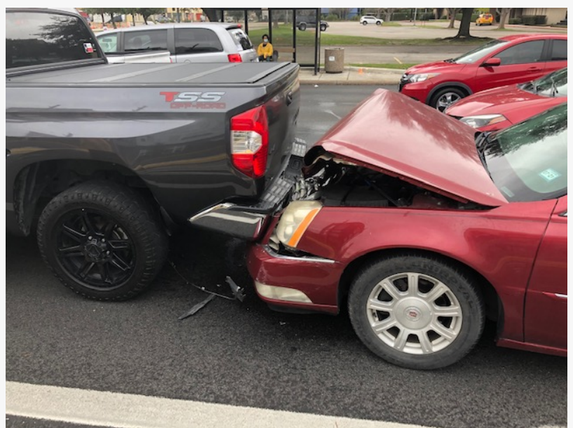
Rear-end accidents injure thousands of people each year, sometimes seriously.

At Rose Sanders Injury Law, we take all of our rear-end accident cases on a contingency fee basis, which means that the person never has to pay up front for legal representation. In addition, we will only collect legal fees if we win the person's case, so at no point they have to pay out-of-pocket.