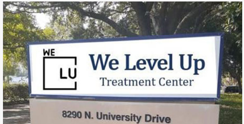
We Level Up Fort Lauderdale Treatment Center

TAMARAC, FLORIDA, UNITED STATES, August 4, 2021 /EINPresswire.com/ -- FORT LAUDERDALE AREA TREATMENT CENTER EXPANSION