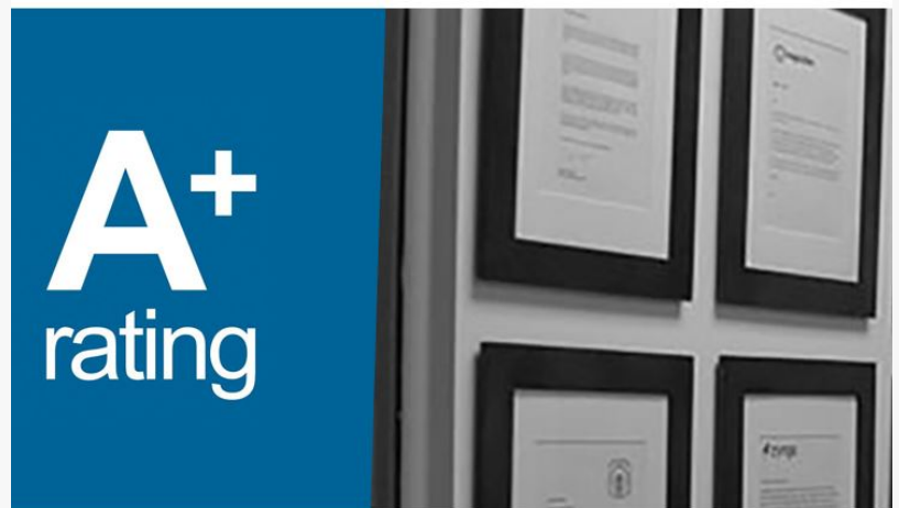
We Level Up Treatment Center Rehab Accreditations