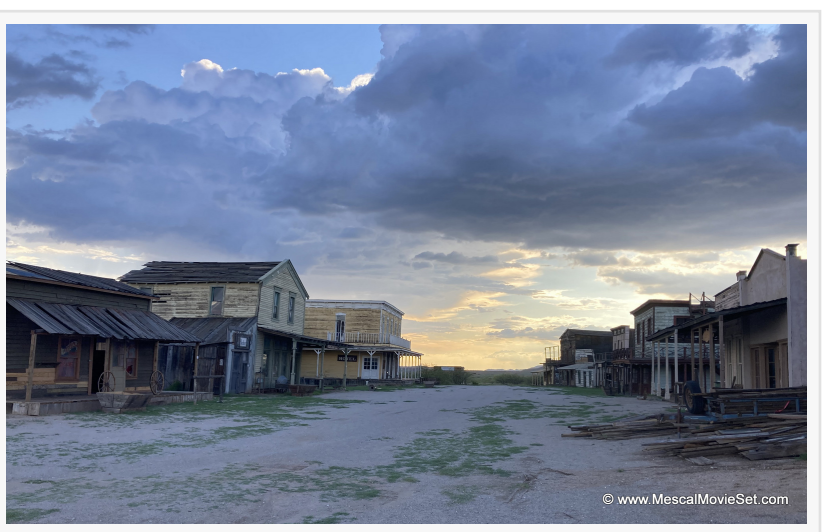
The moment before sunset at the Mescal Movie Set

Extensive plans are in place to renovate the 27 existing buildings, all of which need complete makeovers, from stabilizing foundations, renovating interiors and exteriors, and replacing roofs. New buildings will be added, including a church, blacksmith shop, stage depot, and other essential structures. The set will be rebuilt as an 1860-1920 era western frontier town with interiors staged with appropriate