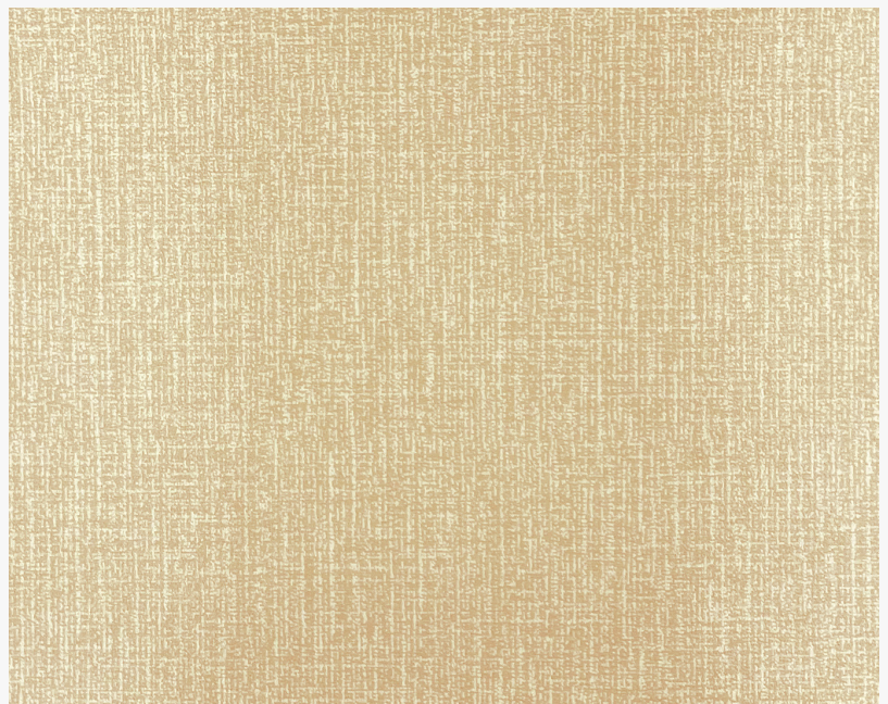
Lonceo Linen Topseal - EL337 COTTON

Lace Greene-Cordts Lonseal, Inc. +1 310-830-7111 email us here