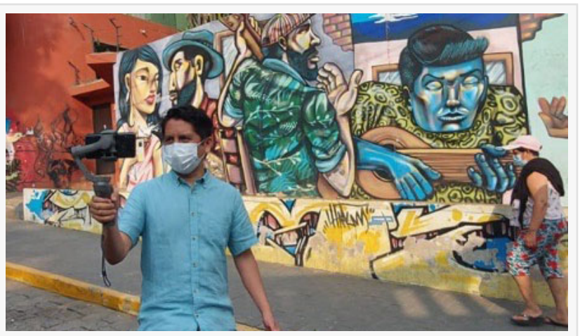
Quimbaya Lima virtual guide live tour

Available in 4 languages (French, English, Italian or Spanish) via a fixed schedule, the live virtual tours are also