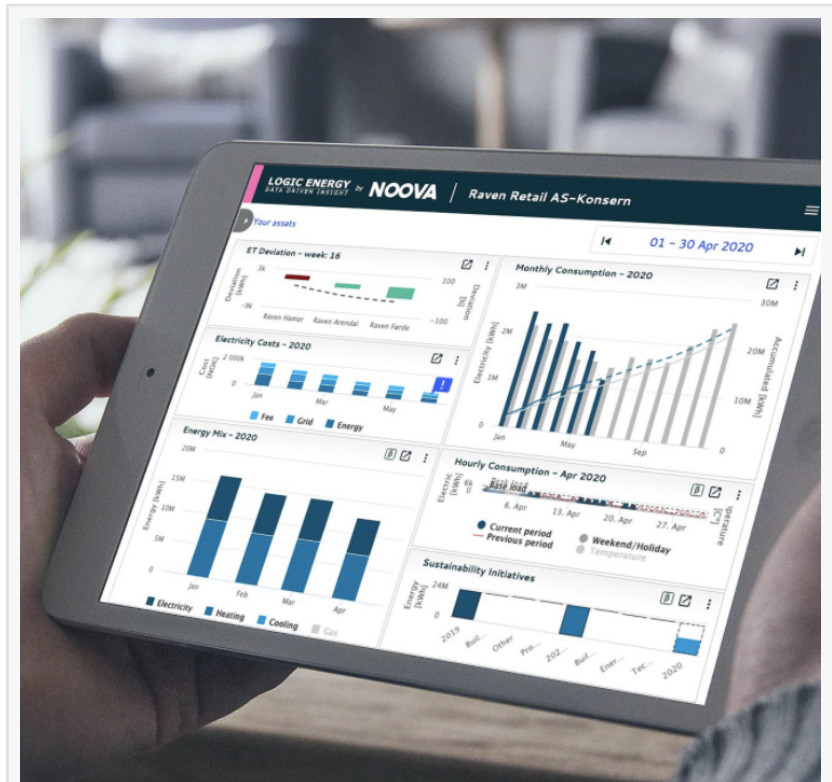
Transmit the building's data to Noova's Logic Energy System