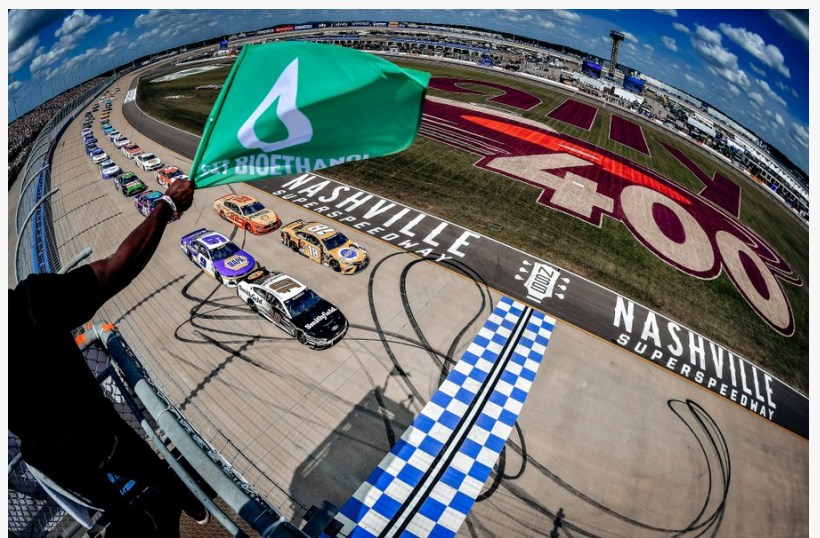
Aric Almirola racing to a top 5 win in the 2021 Nashville 400

Kerry Tracy Digitent +1 917-734-9813 email us here