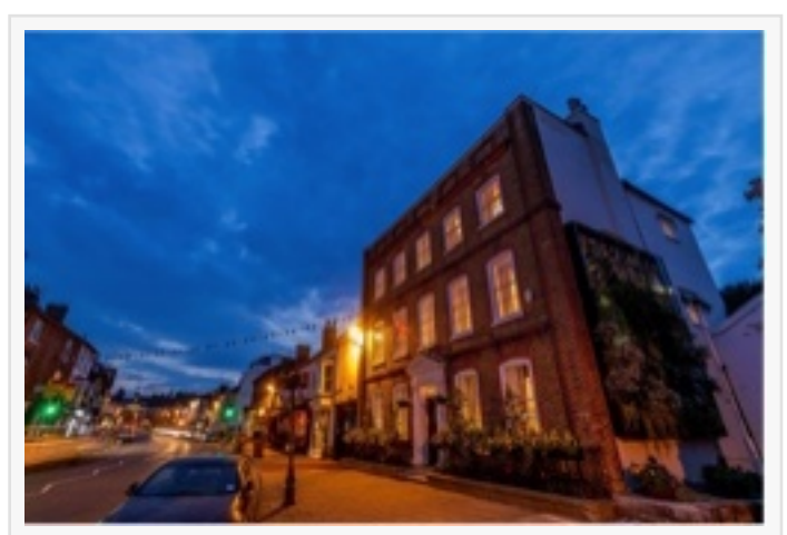
Longlands House in the centre of Henley-on-Thames -famous for the Royal Regatta

LONDON, OXFORDSHIRE, UK, June 21, 2021 /EINPresswire.com/ -- Fine & Country Henley-on-Thames are honoured to be launching to the market on Thursday 24th June with an open day event on Sunday 25th July, Longlands House. Longlands house is considered to be the most desirable homes in Henley-on- Thames. Generously distributed over 4500 sq ft, this remarkable five bedroom Grade II* listed