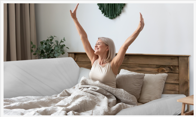
Side Sleeping Adjustable Bed for an Amazing Night's Rest

I can picture a big market for this with boomer who, even if they still have