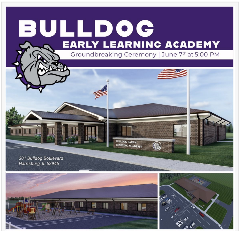
BULL DOG EARLY LEARNING ACADEMY