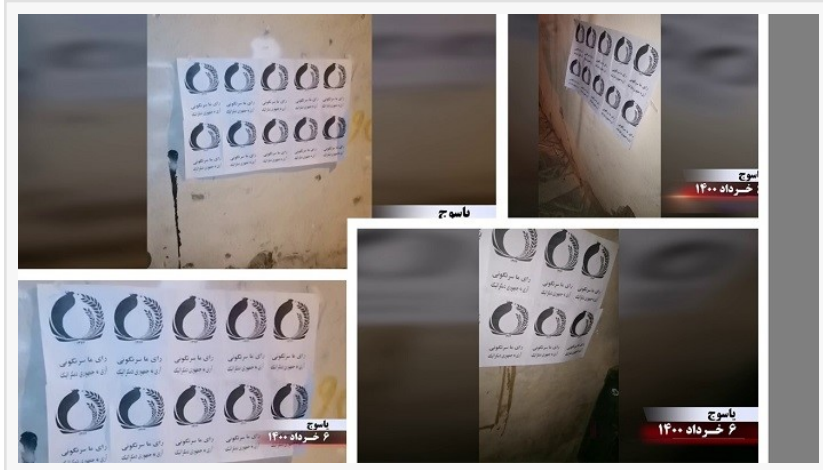
Yasuj - Activities of the Resistance Units and supporters of the MEK, calling for the boycott of the regime's sham presidential election - "My vote is regime change, yes to a democratically-elected republic" – May 27, 2021