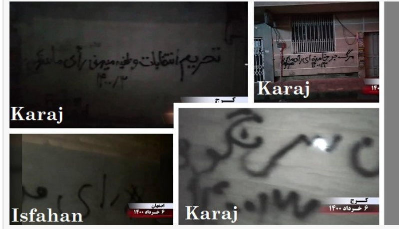
Karaj - Activities of the Resistance Units and supporters of the MEK, calling for the boycott of the regime's sham presidential election - "Boycott of the election masquerade is a patriotic duty, our vore is regime change" – May 27, 2021

"Democracy, freedom, with Maryam Rajavi."