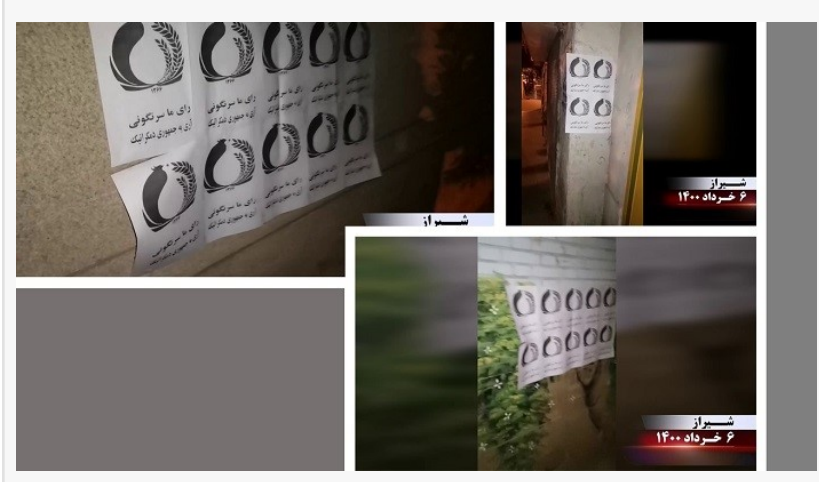
Shiraz - Activities of the Resistance Units and supporters of the MEK, calling for the boycott of the regime's sham presidential election – May 27, 2021