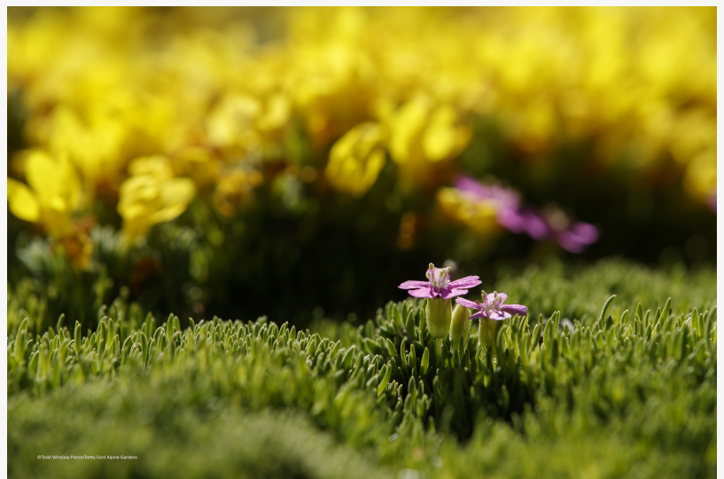
Book Photography by Todd Winslow Pierce

On the Roof of the Rocky Mountains illuminates the Gardens as both a leader in alpine plant conservation as well as a destination in one of America's premier resorts. Its expertly curated and stunningly beautiful botanic displays are located within the Town of Vail's Ford Park, directly across from Vail Mountain, and a short distance from the center of Vail Village.