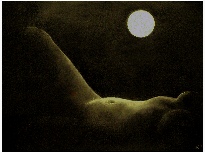
Birthing Moon 1