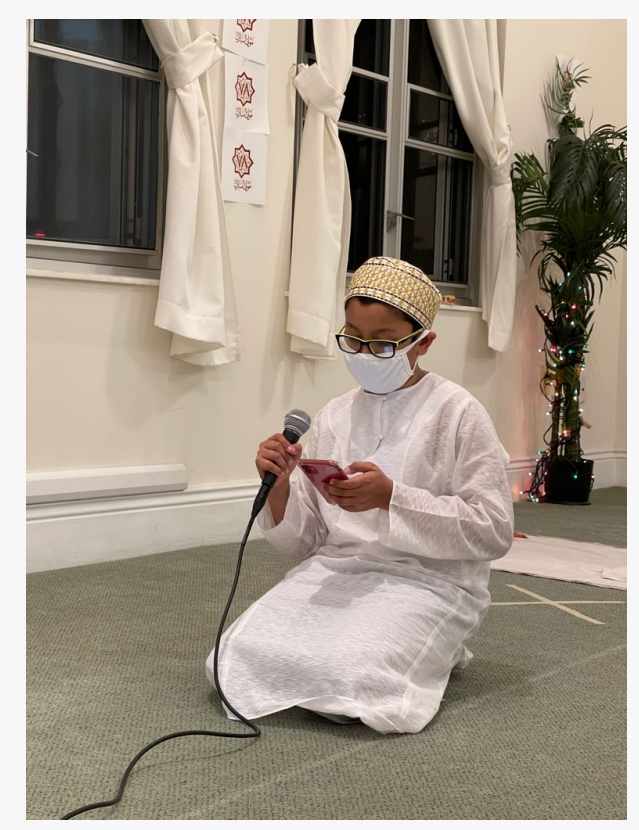
A young Dawoodi Bohra from Washington DC recites the Quran.

This press release can be viewed online at: https://www.einpresswire.com/article/540223875