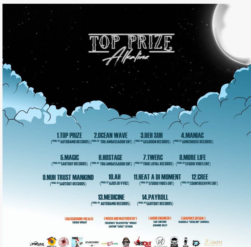
Dancehall Artiste Alkaline reveals the tracklist for this latest project "Top Prize"