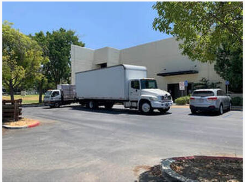
Health Supply Wholesalers PPE Delivery Truck

LOS ANGELES, CA, 90220, April 21, 2021 /EINPresswire.com/ -- Throughout the COVID19 pandemic demand for Personal Protective Equipment (PPE) has consistently outstripped supply. With unprecedented demand globally for items such as nitrile, latex, vinyl gloves, face shields and hand sanitizers many businesses have struggled to affordably source the PPE necessary to make their workplaces COVID secure for their staff and customers. One California-based business is striving to ease this problem for local business owners, by setting up a connected supply chain that allows local business owners to quickly and affordably get hold of PPE from a network of factories across America.