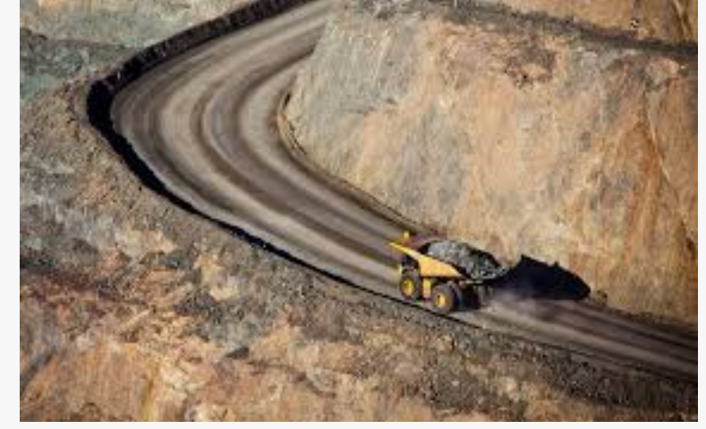
$BRLL Lithium Ion Batteries

stakeholder in Roshan and the expansion of its Lithium battery facilities in India. Roshan has developed an impressive line of Lithium Battery products for Electric Vehicles, Medical Equipment, Solar street lighting, the telecom industry as well as home energy storage solutions. Barrel and Roshan first plan to make a sizeable impact on the escalating small vehicle EV market