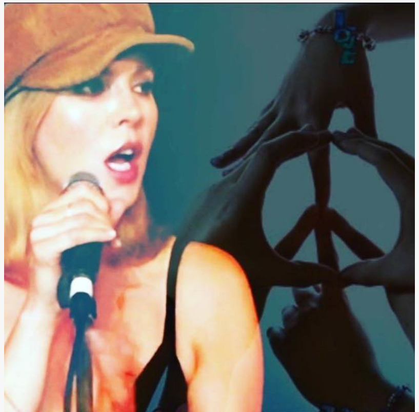
Change The World - Music Video