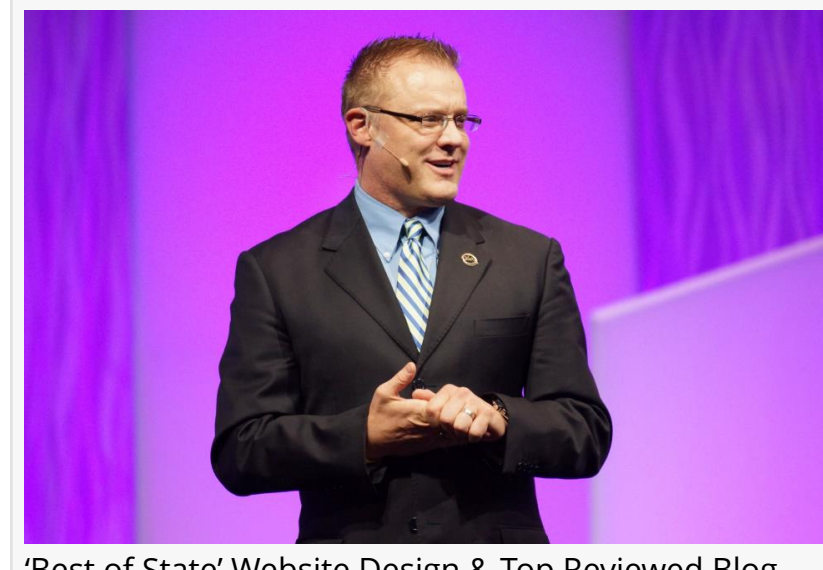
'Best of State' Website Design & Top Reviewed Blog Article Writer

Market, you're not creating opportunities — while your competition is. 7. Social Media saves massive amounts of time and money — if you use it right.