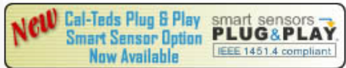
CAL-TEDS Plug & Play Smart Sensors Icon