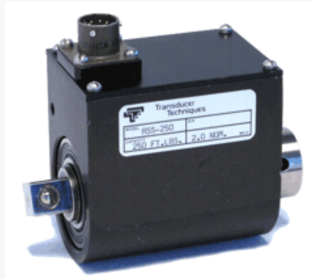
RSS Series Rotating Torque Sensor