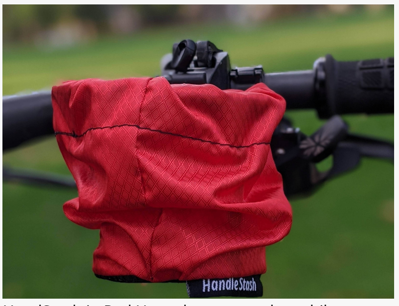
HandStash in Red Hot color mounted to a bike handlebar

HandleStash is made from heavy duty nylon ripstop fabric and has a built-in accordion style spring enabling small drinks to sit up high, while allowing heavier drinks to sink lower for additional stability. The spring allows the drink to "float as if on air." Combined with a drawstring cinch at the top, the holder has proven excellent at shock absorption, preventing spills and the ejection of drinks when riding, even over bumpy terrain. It holds anything from skinny cans to 32oz to-go cups and can rotate 360 degrees to attach to almost any handlebar.