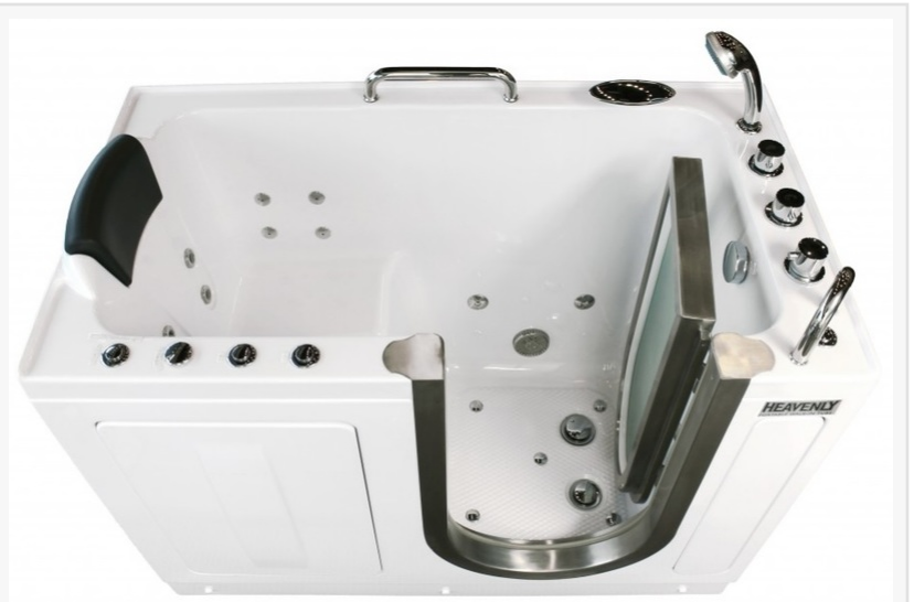
PORTABLE 'Best of Industry' Top Rated Walk-in Tub