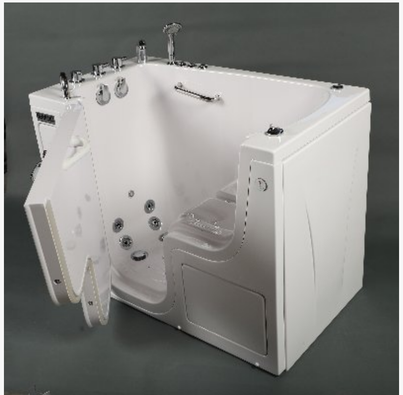
Made-in-USA Top PORTABLE Walk-In Tub 855-400-4913

.HeavenlyTubs.com America's Best PORTABLE Tub