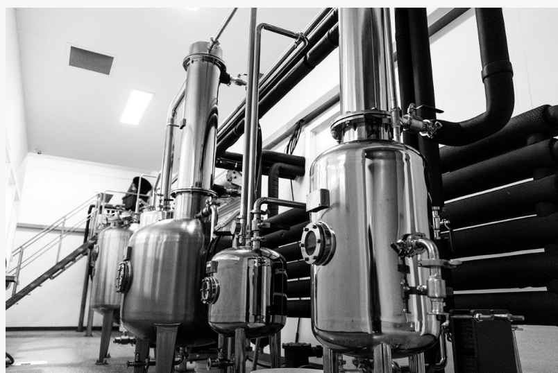
State of the Art CO2 Extraction Facilities Are Used To Produce High Quality CBD

Ancient Antidotes sets itself apart with their biodynamically grown formulas. They contain the full range of terpenes and beneficial cannabinoids that are only found when they are extracted from the entire hemp plant. One of the first fully USDA certified hemp farms is located just three miles from the state-of-the-art extraction facility in Philomath, Oregon. There are no artificial ingredients or pesticides involved in any part of the process. Ancient Antidotes go well beyond