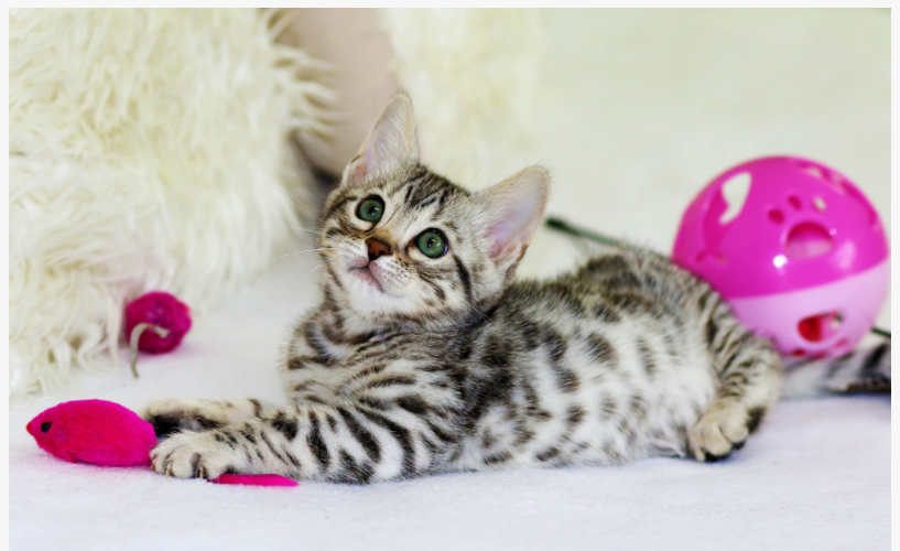
Brittany Golden Ballwin