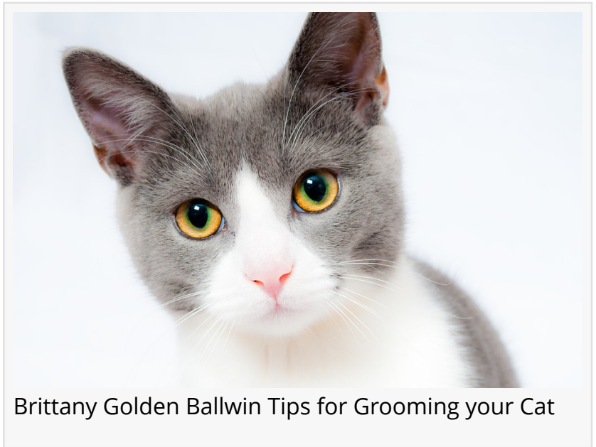
Brittany Golden Ballwin Tips for Grooming your Cat

shampoo. Before the bath, according to Brittany Golden Ballwin, give him a good brushing to remove any matted up hair, as well as debris. Brittany Golden Ballwin recommends using a non-slip mat in a sink or tub to keep your cat from sliding around during the bath.