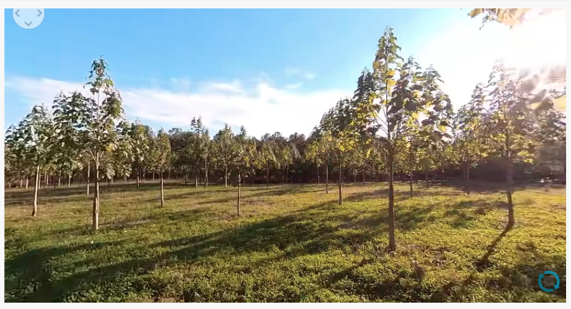
Visit a World Tree farm in 360 with Virtual Reality.

About World Tree: World Tree USA, LLC ("World Tree") is an agroforestry