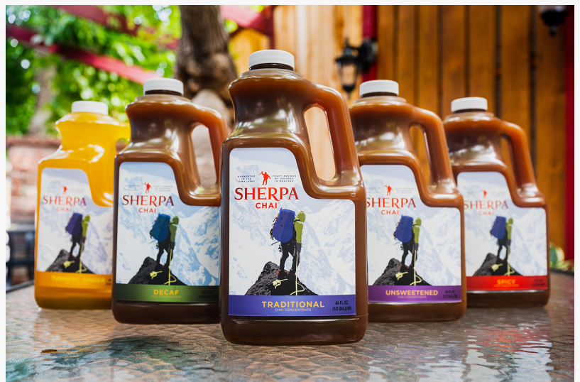
Top Selling Sherpa Chai Specialty Beverages